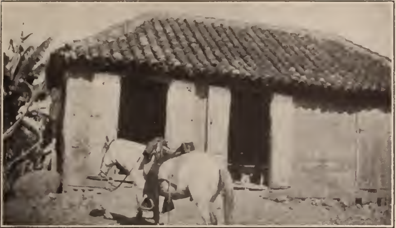
A COUNTRY HOUSE USED AS A CHAPEL

of thousands of dollars; and there are schools and hospitals which testify to the truth that the Gospel there preached takes in every higher interest of the people. At first the churches operating there found it difficult to secure much cooperation in the way of financial support from the people themselves, but latterly they are beginning to appreciate their responsibility for helping to maintain the ordinances of religion in their communities, and many out of their poverty are giving abundantly.